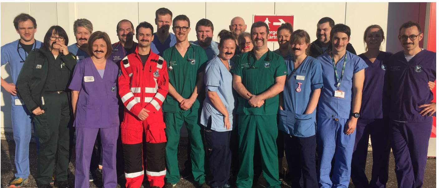
The ED Team raising funds for "Movember"

We thrive on shared learning and experiences and have a sense of teamwork and comradery that is second to none.